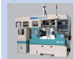
CNC Turning Machine