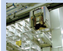
FA systems for Clean Rooms