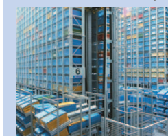
Logistics Systems / FA systems