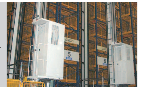
AS/RS(Automated Storage & Retrieval System) at Airport Authority of India/Kolkata

The AS/RS implemented at NSCBI Airport Kolkata is the first AS/RS in Airport Authority of India for handling import cargo. The storage and retrieval of import cargo is completed automated with - 5Stacker Cranes, 14m Rack height having around 1900+ storage locations with load weight of 1000kg. Metronic, the Operation & Maintenance contractor for this system, says "Since beginning of operation in Aug. 2008., this system has been running smoothly and Muratec AS/RS improves a quality of cargo operation dramatically."