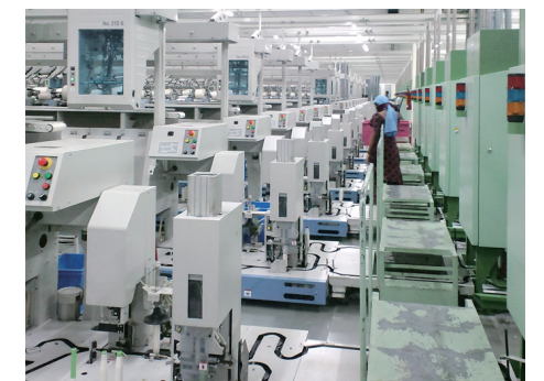
No.21 C PROCESS CONER