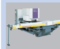
Sheet Metal Machinery

Muratec is active in six diversified business fields linked with accumulated knowhow of technology and marketing and offers you the best proposals and solutions to meet your needs in each specialized field globally. In India too we provide you the latest technology with strong localized support organizations.