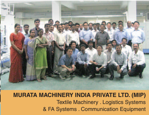
MURATA MACHINERY INDIA PRIVATE LTD. (MIP) Textile Machinery . Logistics Systems & FA Systems . Communication Equipment