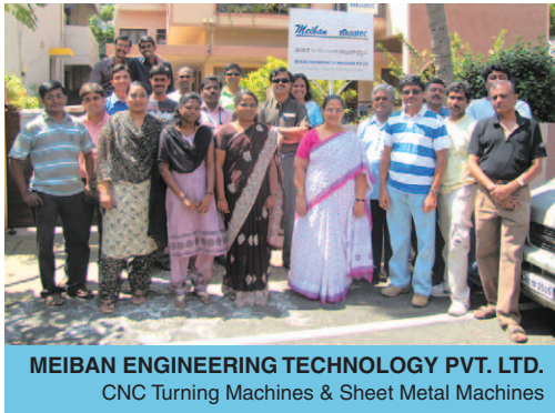
MEIBAN ENGINEERING TECHNOLOGY PVT. LTD. CNC Turning Machines & Sheet Metal Machines