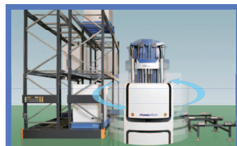
Minimized turning radius of 1.2m.