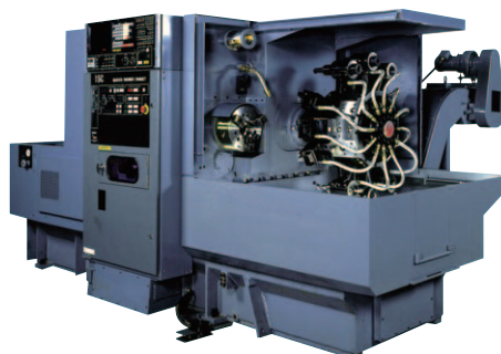
Murata Warner Swasey CNC Single Spindle Chucker Model 1-SC (1981)