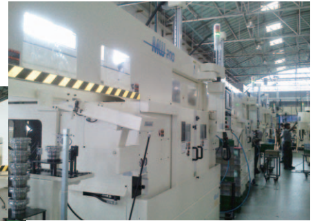
Muratec CNC Twin-Spindle Chucker MW200G – 6 lines x 2 machines in line (2013)